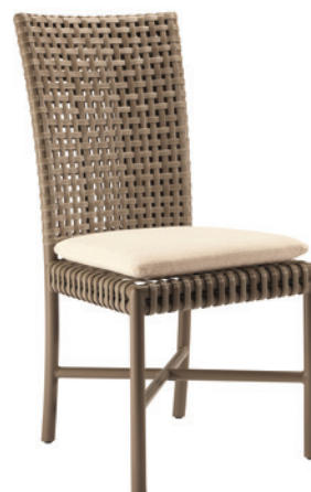
Antalya Outdoor Tall Back Side Chair by McGuire Furniture, $840 . LRB Associates in Torrance. 310-316-9215