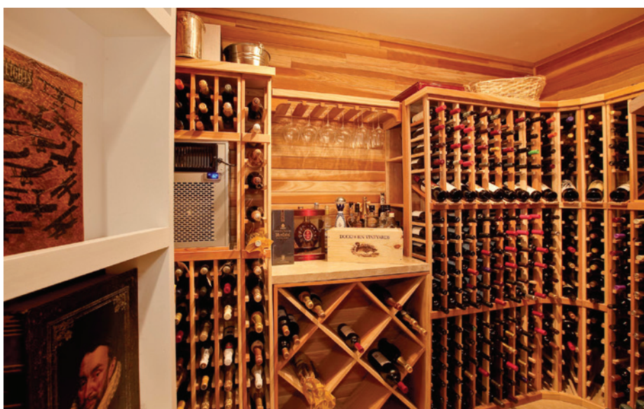
Top to bottom: Light pours into the great room via sliding doors that open to the pool and ocean view; wine and other fine liquors are carefully stored in an impressive wine cellar; furnishings were kept to a minimum to honor the desire for simplicity.