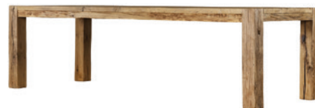
Parsons Reclaimed Russian Oak Dining Table, $2,495 to $3,495 . Restoration Hardware. restorationhardware.com