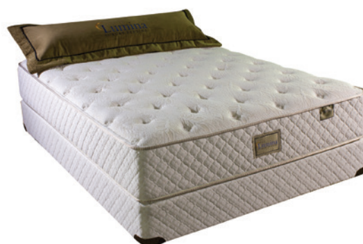
Sherwood Lumina Spirit Luxury Plush Mattress, $980 . Sit 'n Sleep in Torrance. 877-697-7610, sitnsleep.com