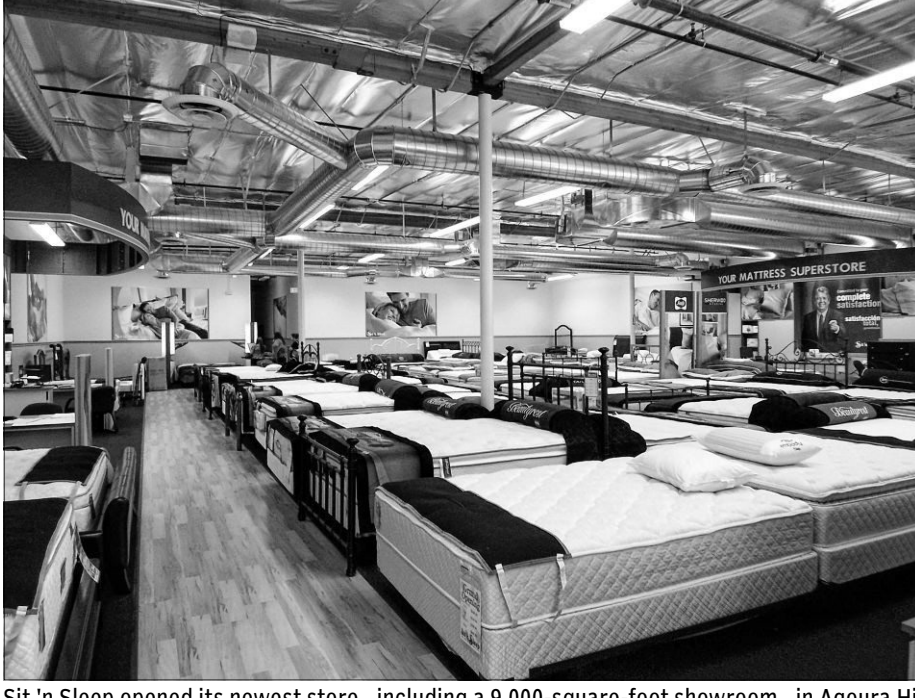
Sit 'n Sleep opened its newest store-including a 9,000-square-foot showroom-in Agoura Hills this week.

Olbs.-10 lbs. 11 lbs.-20 lbs. 21 lbs.-55lbs