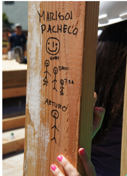
Habitat for Humanity volunteers, donors and future homeowners signed their names on the framing of the Canon Perdido Affordable Homes project.